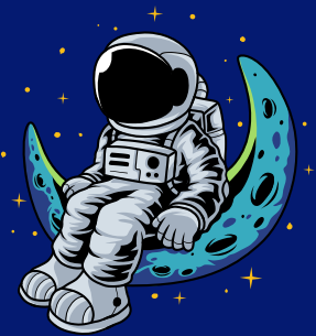
CHART YOUR COURSE TO FINANCIAL INDEPENDENCE!

As Youth Month orbits into view, the family here at Modesto's First FCU has launched a cosmic campaign to ignite the financial journey of teenagers, propelling them into the vast expanse of personal finance. Picture us as a stellar spacecraft, charting the course for young pioneers as they venture into the realms of checking accounts, debit cards, and their inaugural savings and checking ventures. Every Wednesday afternoon, we're dedicated to Youth Accounts and Members, staying open until 6:00 p.m. Join us on 4/3, 4/10, 4/17, and 4/24 to open custodian accounts, minor savings or checking accounts, and more. Plus, mark your calendars for our "Out of this World" Youth Month event on Saturday, 4/27 from 10:00 a.m. to 3:00 p.m. at our branch. Enjoy food, fun, and giveaways for all attendees!